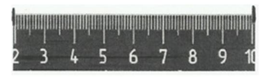
Figure 2. Broken ruler

physically showing how many centimeters there are in a meter is an effective way to help students understand conversion rules conceptually. Furthermore, one of US pre-service teachers explained that using different rulers, such as 30cm in length or 20cm in length, can be helpful to show length of an object would be the same regardless of the ruler's length. Similar to this suggestion, Turkish pre-service teachers explained that having students design their own rulers may enable them to notice their errors. Other strategies suggested by Turkish pre-service teachers to overcome these errors were re-teaching the topic, solving enough conversion examples, and making students familiar with these kinds of rulers. In addition to practicing enough examples before letting students solve conversion examples on their own, two US pre-service teachers stated that distributing a conversion rule sheet may be useful when students could not remember the rules.