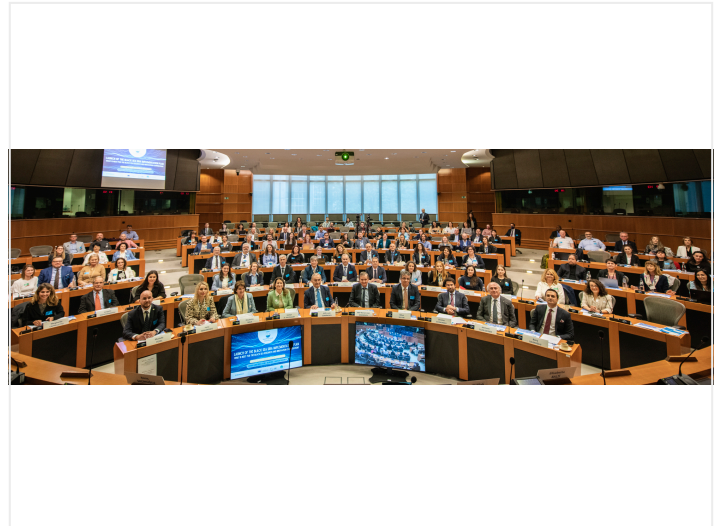
Launch of the Black Sea SRIA in European Parliament on 4 May 2023