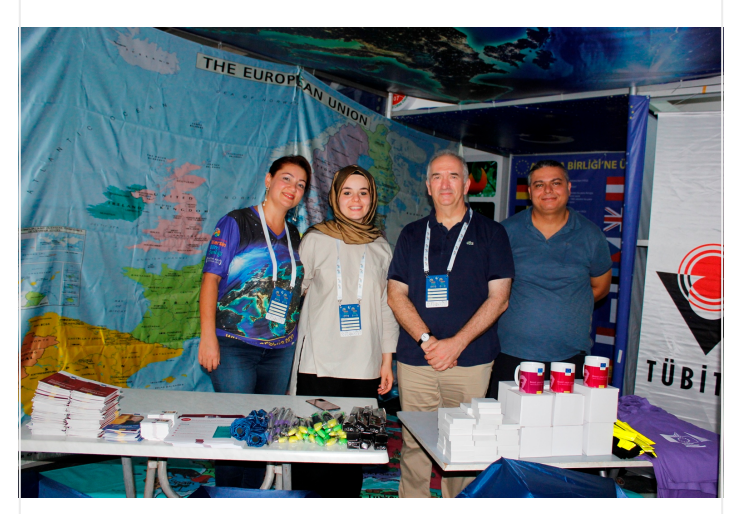
European Corner at the entrance of event