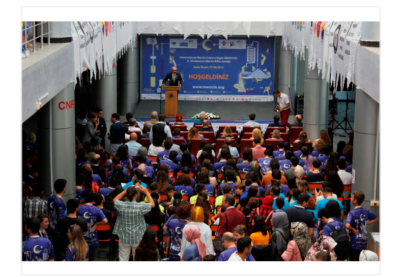
Opening Speech of Vice-chancellor 27 sep 2019

- A total of 2,000 people participated in the measurement and evaluation survey conducted within the scope of Merscin "Science Festival but 1712 people were considered valid.