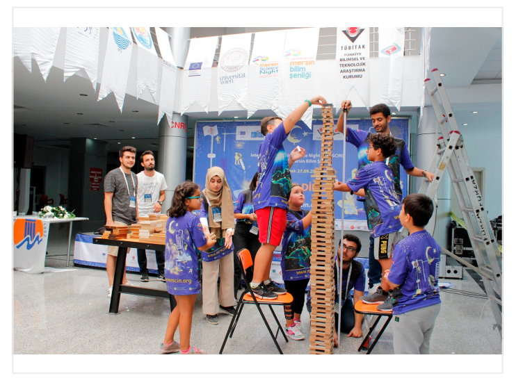
The Highest Tower Competition 2019