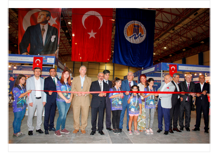
Opening ribbon cutting of Merscin Event 27 sep 2019