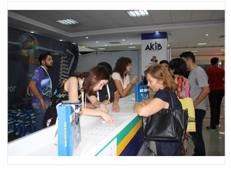
Registration and Information Desk of Merscin Event 2019