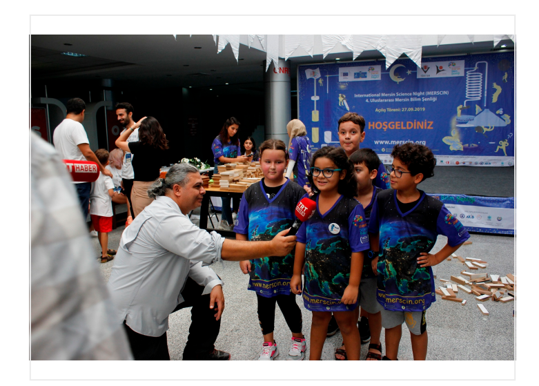
Students who won the competitions in Merscin Event 29 sep 2019