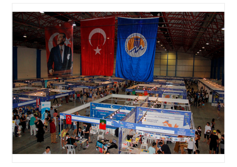
CNR EXPO Fair Area during the Merscin Event 2019