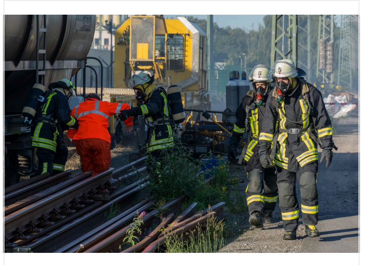
Field exercise, Dortmund, Germany, September 2019