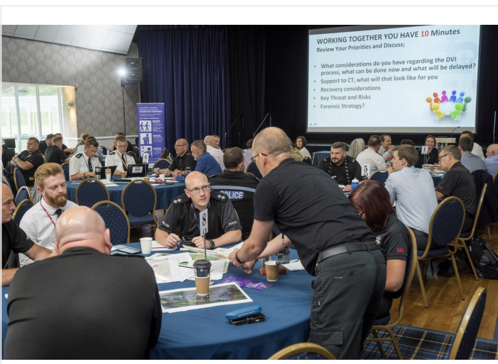
Table top exercise, Birmingham, UK, July 2019