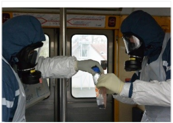
Field exercise, Gurcy, France, December 2017