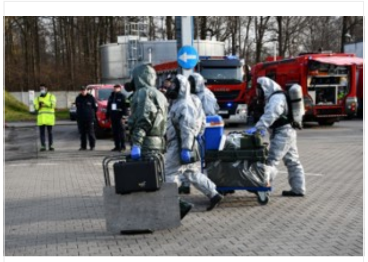
Civ-mil exercise in Warsaw, Poland, November 2021