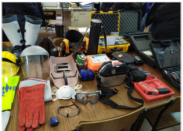
Serious gaming, Ankara, Turkey, February 2020