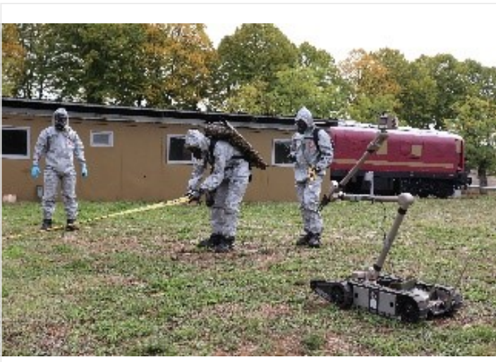
Military exercise in Rieti, Italy, October 2018