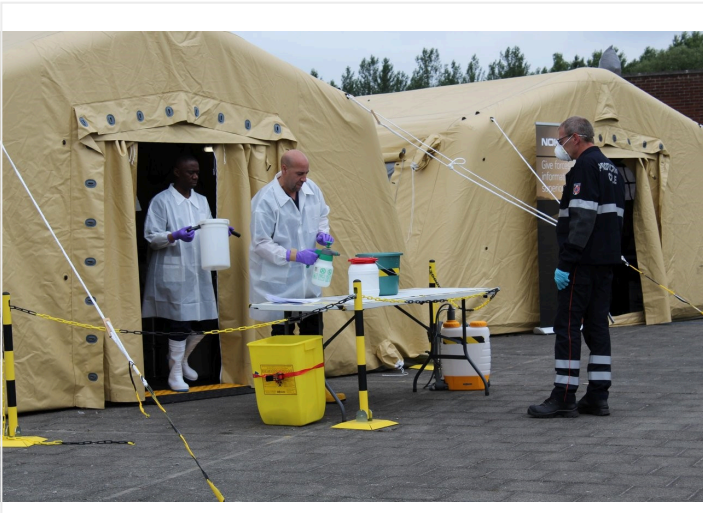
BioGarden exercise, Peutie-Vilvoorde, Belgium, June, 2018