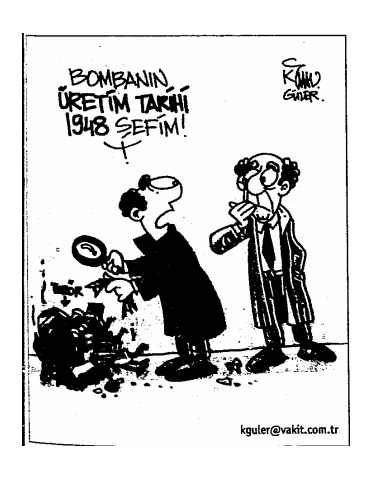
"Chief! The production date of the bomb is 1948".