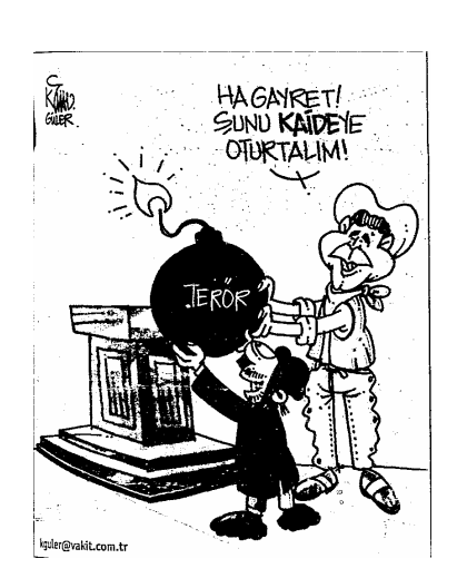
U.S. and Israel are trying to put the blame on 'kaide', making a word play with the words Qaida/kaide

Bush: Come on, let's get this placed on the kaide (base)