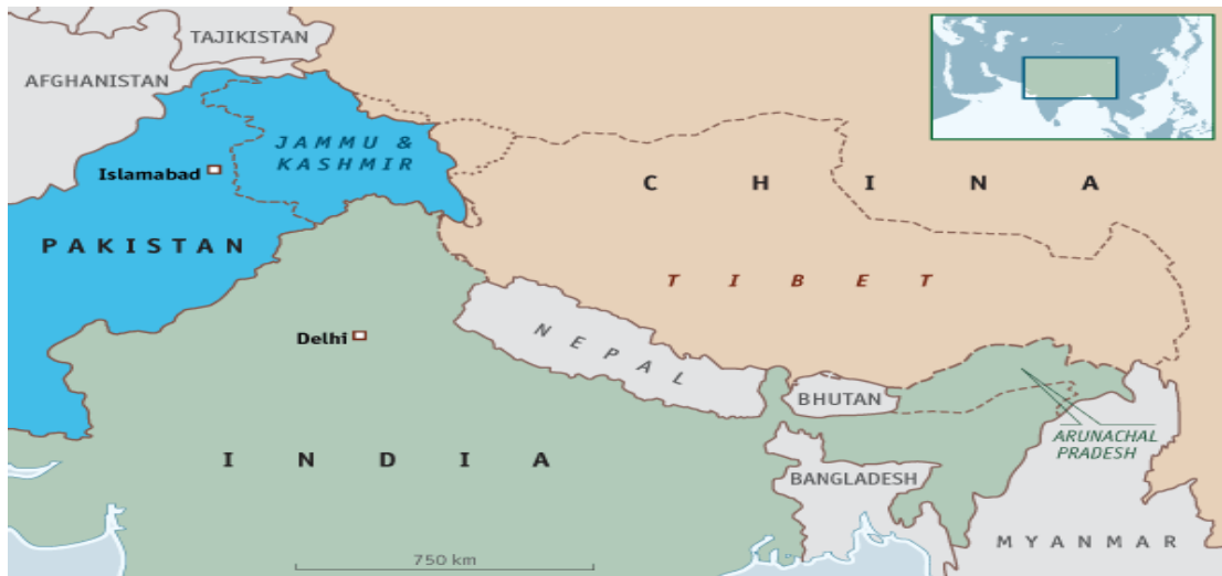
Figure 3 (Disputed Territories between India and Pakistan) 110

the division of the borders in the hands of civil servants which had limited knowledge of the geography of the region. Figure No. 3 shows the disputed territories between India and Pakistan, and figure No. 4 shows the major disputed territories in the region.