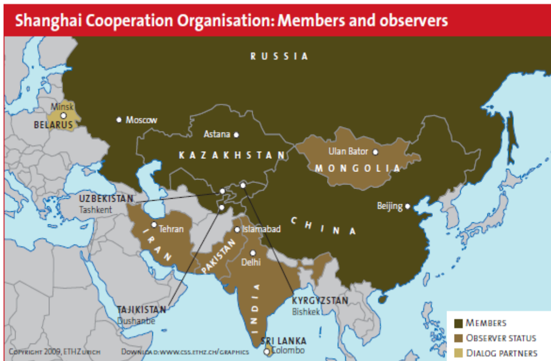
Figure 1 (Shanghai Cooperation Organization: Members and Observers) 12

taken from an article published by the Center for Security Studies (CSS), ETH Zurich. 11