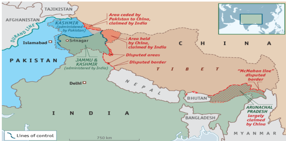
Figure 4 (Disputed Territories between India and Pakistan and India and China) 111

The major argument of this thesis is that all the countries that are somehow connected with the SCO have more or less same kind of problems, such as terrorism, extremism and separatism. Above all these issues, the largest countries have frozen conflicts with each other, top of the list are India, Pakistan and China. The maintenance of peace is not only inevitable for Pakistan and India but also carries major weight for China to achieve the ambitious trade targets it has. It is a proven fact that without peace and security it is almost impossible to achieve growth in long term. This is expected that the SCO can be helpful to find some strategic solution which would bring all the members and the observers at the same page to bring prosperity in the entire region.