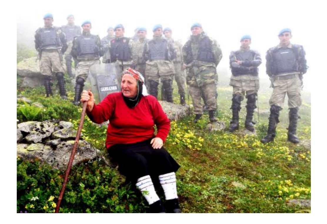
Figure 11: A village woman as a symbol of protests against hydropower plant in Çamlıhemşin

grandchildren sit stone of this plateau, smell the flowers in there. She is aware of possible environmental degradation if these plateaus are connected with roads. According to Rabia Özcan, in these Green Road protests women are at the forefront because women cultivate soil and women value these plateaus. She says that since childhood, women have taken the trouble of agriculture in this area. Men cannot understand this situation because they do not make efforts for agriculture as women do ("Rabia Özcan: Durmak Yok…", 2015).