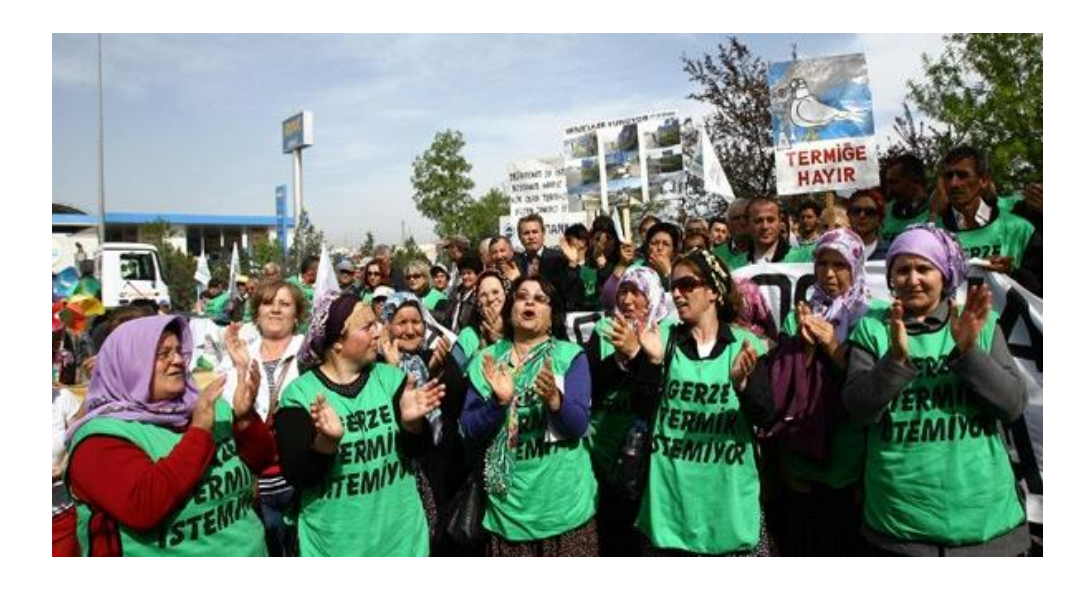
Figure 2: Women in resistance against thermal power plant in Gerze

of Chipko movement, a forest conservation movement led by women in India in 1970's, still continues (Şahin, 2015: 453).