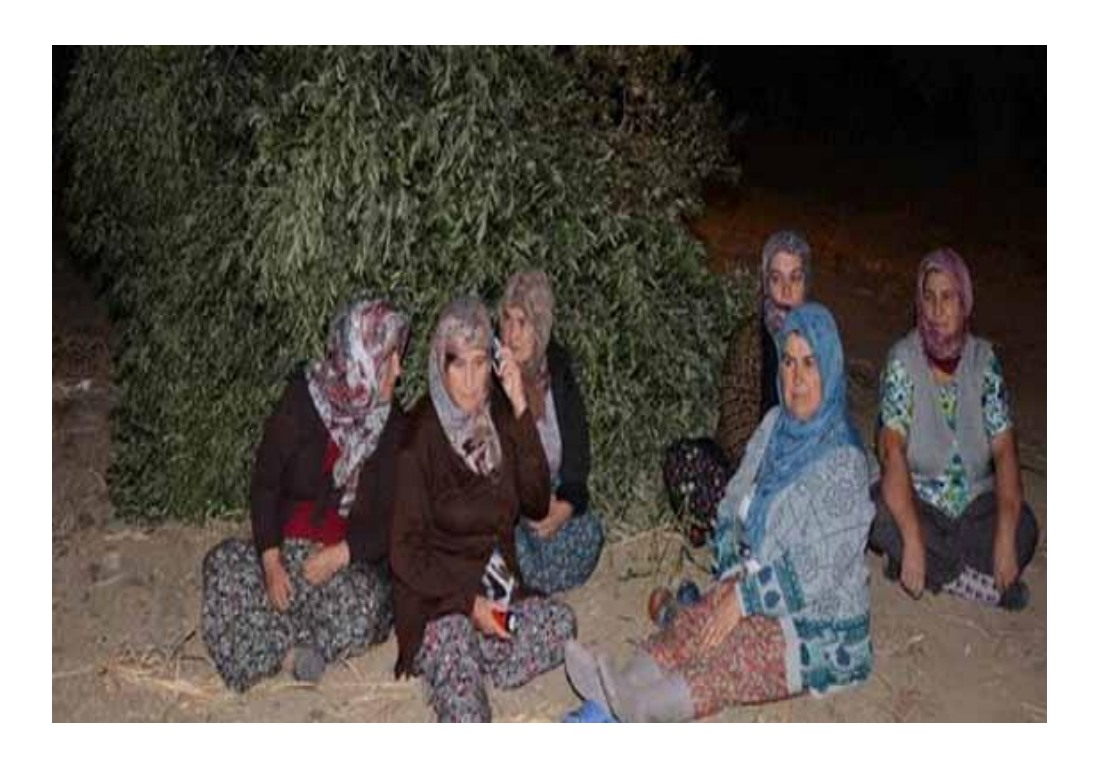
Figure 15: Village women in night watch to prevent cutting down trees in Yırca