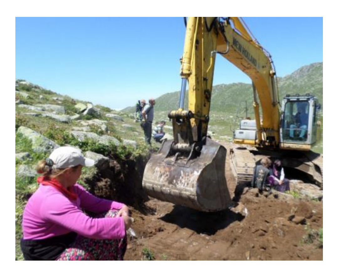
Figure 12: A women stood in front of bulldozers to stop road construction in Çamlıhemşin