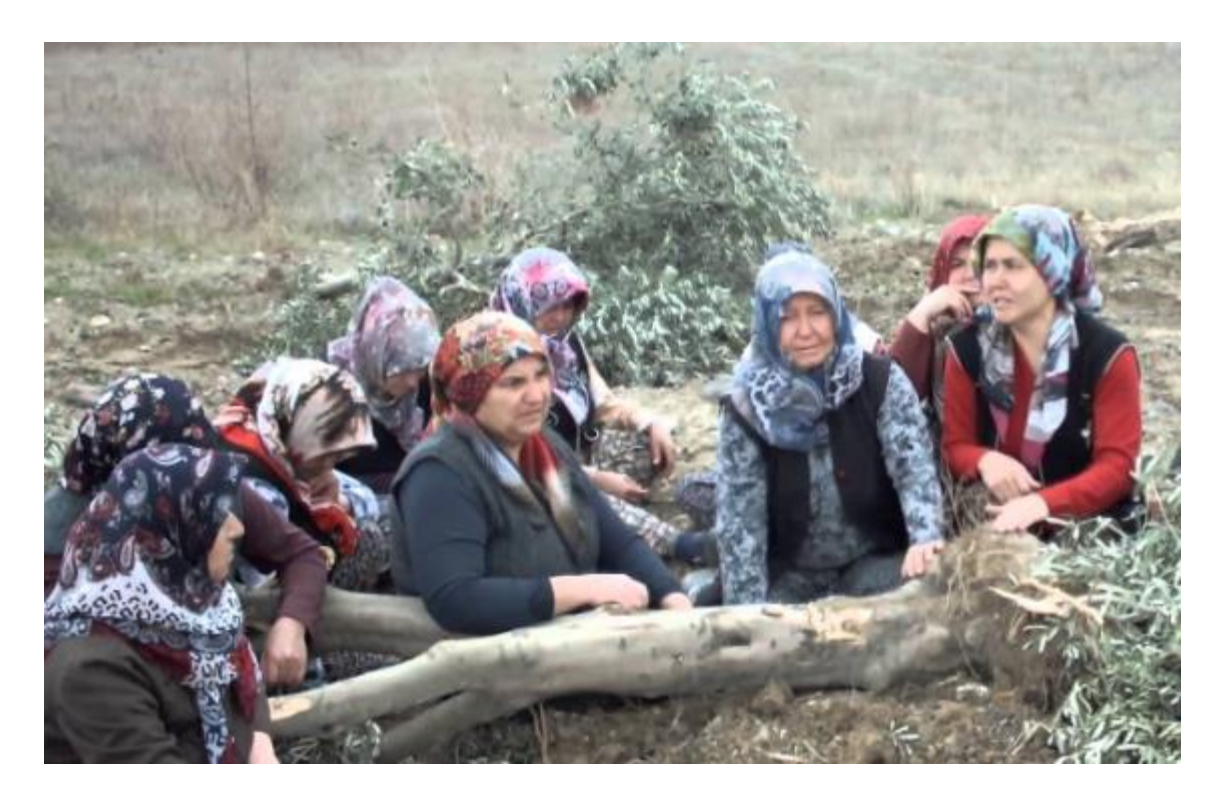
Figure 16: Women whose olive trees were cut down for thermal power plant in Yırca

babies; I did not take care as much of my babies as I cared for my trees. In the one part of the documentary, the district governor of Soma asks villagers what they do if this coal thermal power plant project is not cancel and women answer "we will resist." Then, the district governor says they are provocateurs but a woman says there is a democracy in this country. Nevertheless, the district governor's answer is that people have no right to revolt against the government. After their 6.000 olive trees were cut down, women took an olive tree to leave in front of the Governorship of Manisa. They wanted to meet the governor but he was busy so he did not talk with them.