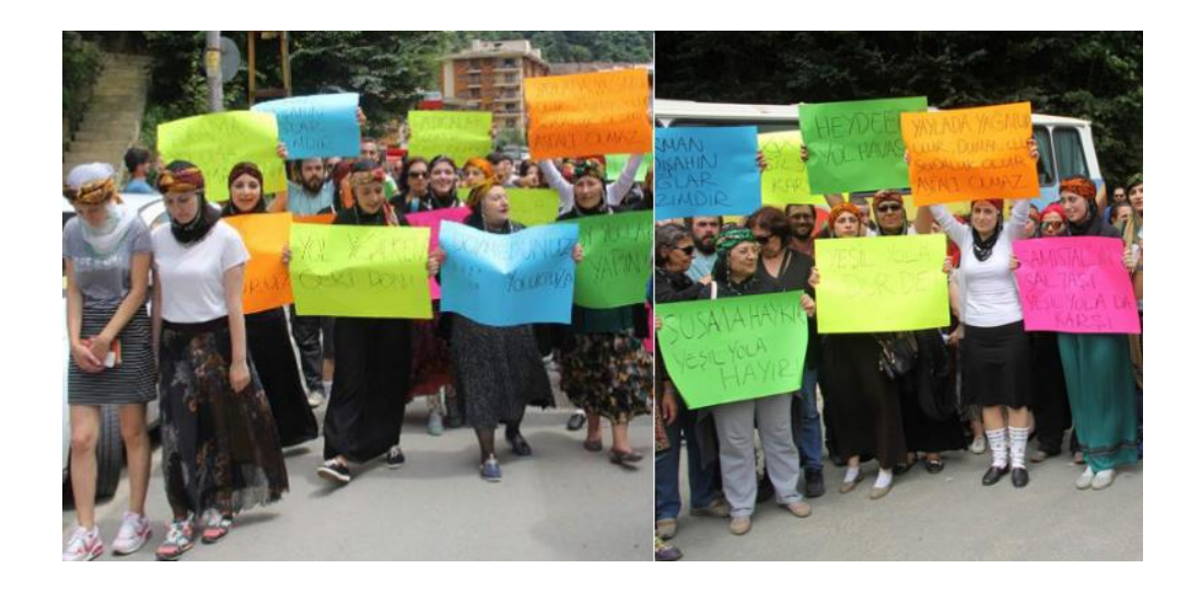
Figure 13: Women activists in local dress in Green Road protests