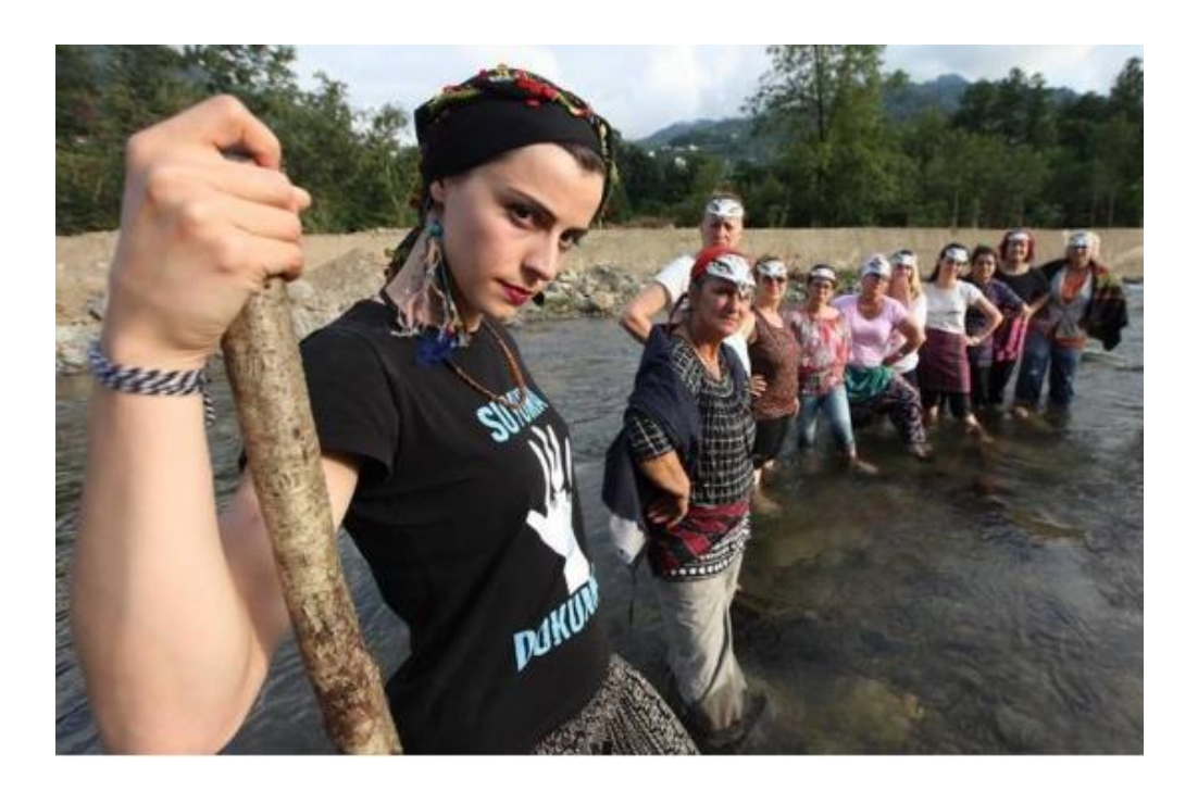
Figure 3: Women in resistance against hydropower plant in Fındıklı, Rize