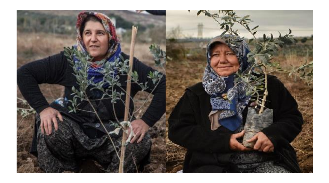
Figure 17: Women who plant olive trees after their trees were cut down

In this environmental resistance, firstly they went out to stop vehicles and hug trees, and then men in the village joined them to protest. So, without women in Yırca, men cannot win alone. They emphasize that they have to resist against the establishment of coal thermal power plant because lung diseases like asthma and lung cancer are very common in Yırca. They are aware of the negative impacts of this thermal reactor on their health and nature. Olive trees are vital in Yırca because poisonous gas and ashes caused by the first coal thermal power plant destroyed tobacco. Greenness of Yırca has disappeared in time until villagers planted olive trees. It was difficult to grow other crops in this region because of air pollution. The soil had become unproductive and only olive trees could endure this pollution.