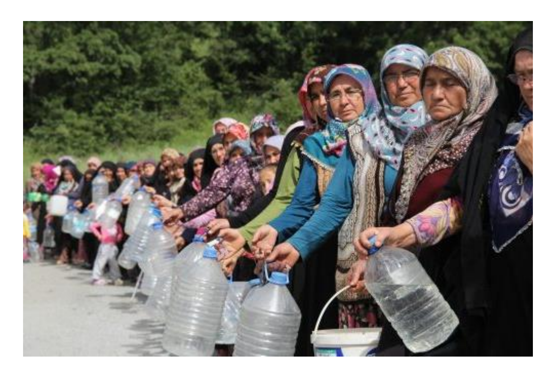
Figure 1: Women who carry water from fountain in rural area in Turkey

clothes of all family members, sometimes carpets and quilts, in the river in Turkey. Furthermore, they wash the dishes and clean their houses so, they need water (Kocabiçak, 2010: 122). Because women shoulder responsibility for house works, besides agricultural works and animal care, they need to access more water than men's need. This need comes from their responsibilities given by the society. Because tasks to care of child and family and also housework associated with women's gender role by patriarchal society, they try to fulfill their responsibilities.