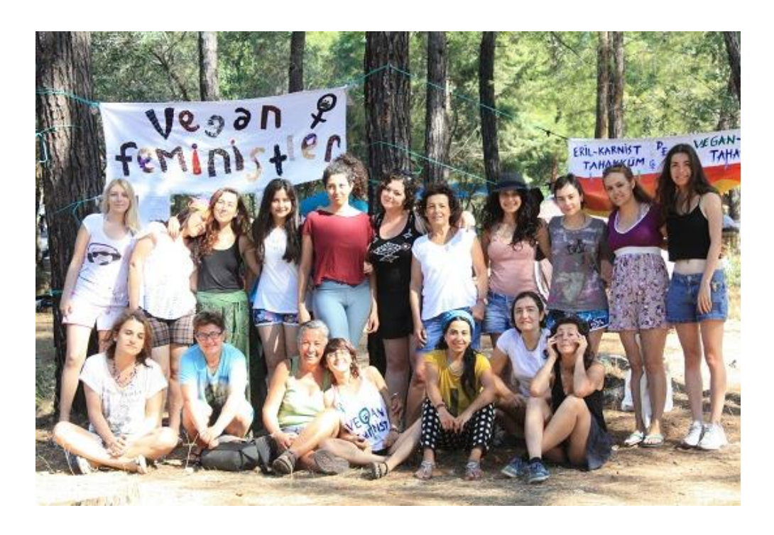
Figure 7: Vegan Feminist Camp in Akkuyu, Mersin