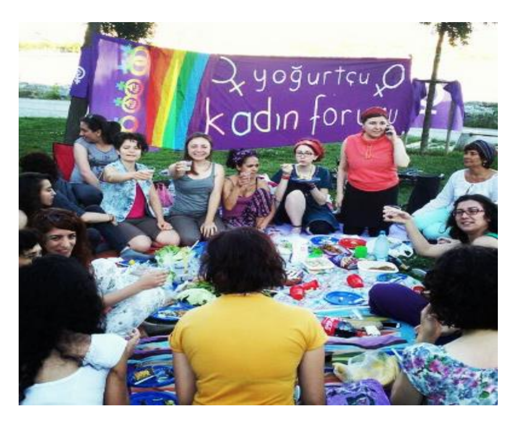
Figure 5: Yoğurtçu Kadın Forumu in Gezi Protests

cut down in Gezi Parkı so, her first reason to participate in the protests was plundering of nature and disruption of her living space. She also was there for female demands like stop AKP's intrusive policies on female body and life (Kaya, 2014: 32). One of the meetings of women in Yoğurtçu Kadın Forumu, they discussed on ecofeminism. They discussed the problem of putting women in secondary position almost in every field of life but perceiving ecological problems is concern of only women. Moreover, in this meeting the nature and women link might be a product of patriarchal system and might reinforce gender roles in the society was debated (Şahinler, 2013).