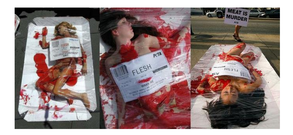
Figure 9: Sexualized images of women activists in animal-rights campaigns of PETA