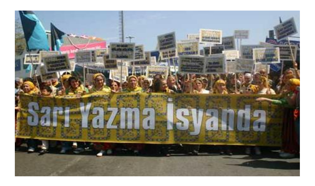
Figure 4: Women activists in protests against hydropower plants in Cide, Kastamonu