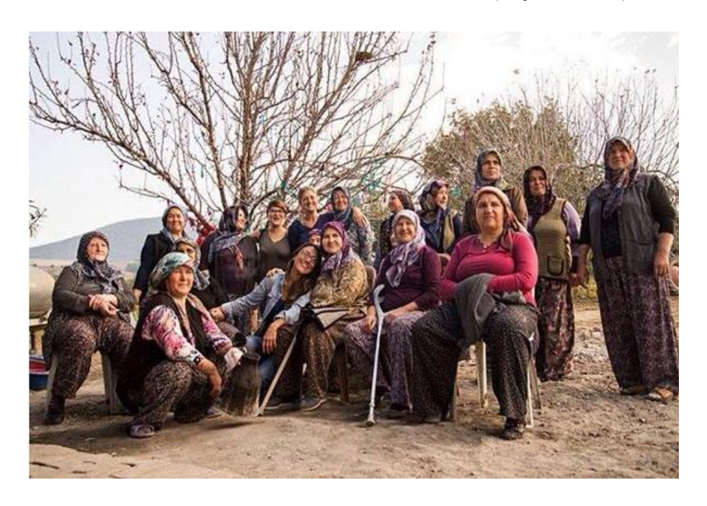
Figure 14: Village women kept vigil near olive trees in Yırca

establishment of coal thermal power plant and the governor reply them by saying "How are you talking like that? All women become good lawyers." <sup>18</sup> Because patriarchal symbols like a commander of the gendarmerie or a state official are not used to women's struggle in an environmental issue in Turkey, they did not know how to react the resistance of women in Yırca (Bayram, 2014).