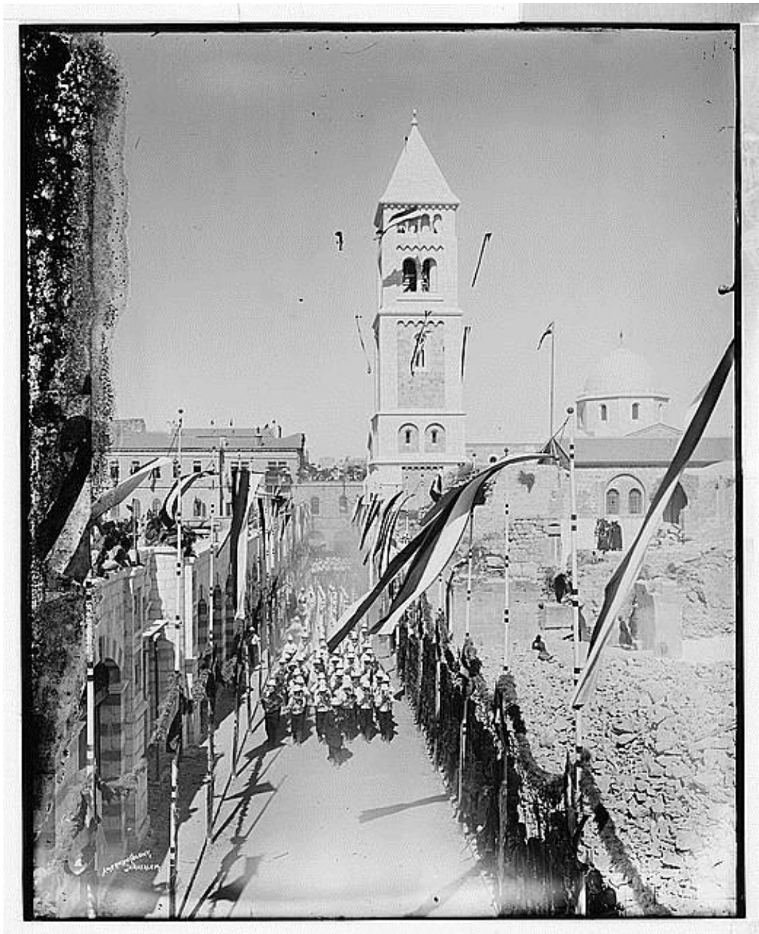
Military band in street parade beside German Church of Redeemer, 1898 Emperor visit / American Colony, Jerusalem

http://www.loc.gov/pictures/item/mpc2004007406/PP/