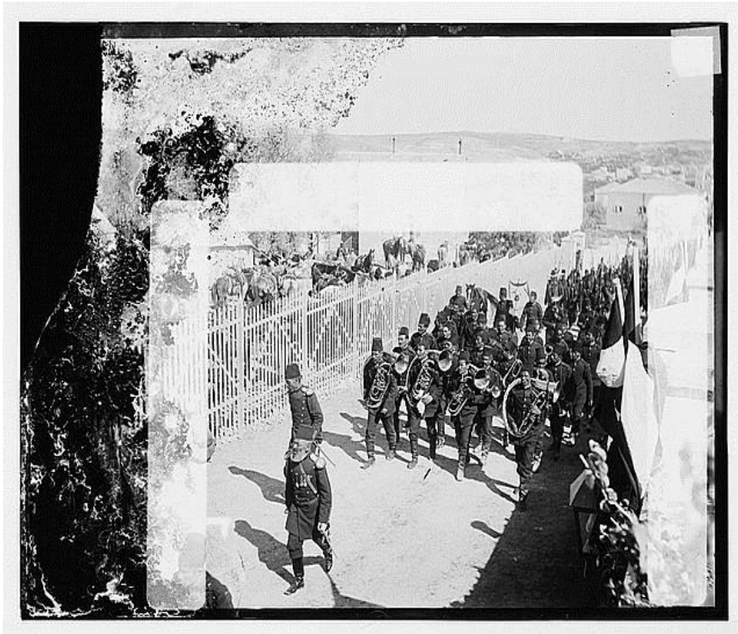
State visit to Jerusalem of Wilhelm II of Germany in 1898. Turkish military brass band in procession to German camp