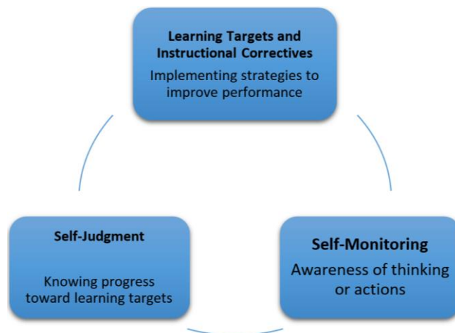
Figure 2.1. Self-Assessment Process for Students (Mcmillen and Hearn, 2008: 41)

In order to have an efficient self-assessment process, students must have an idea about targets and they must be good at self-monitoring and self-judgment. That process is illustrated at Figure 2.1.