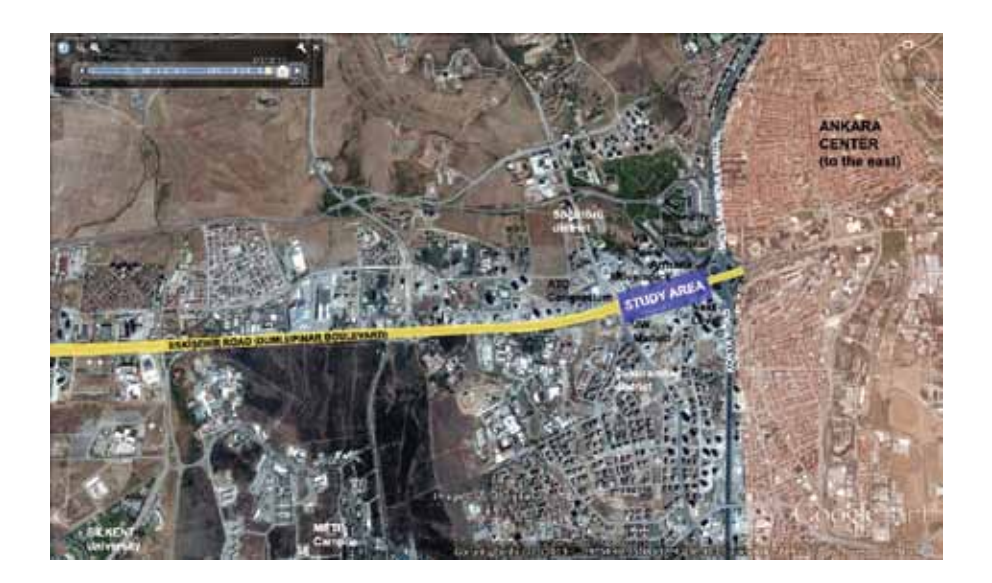
Figure 1. The study area on Eskişehir road in July 2013 (indicated by authors on googleearth images).