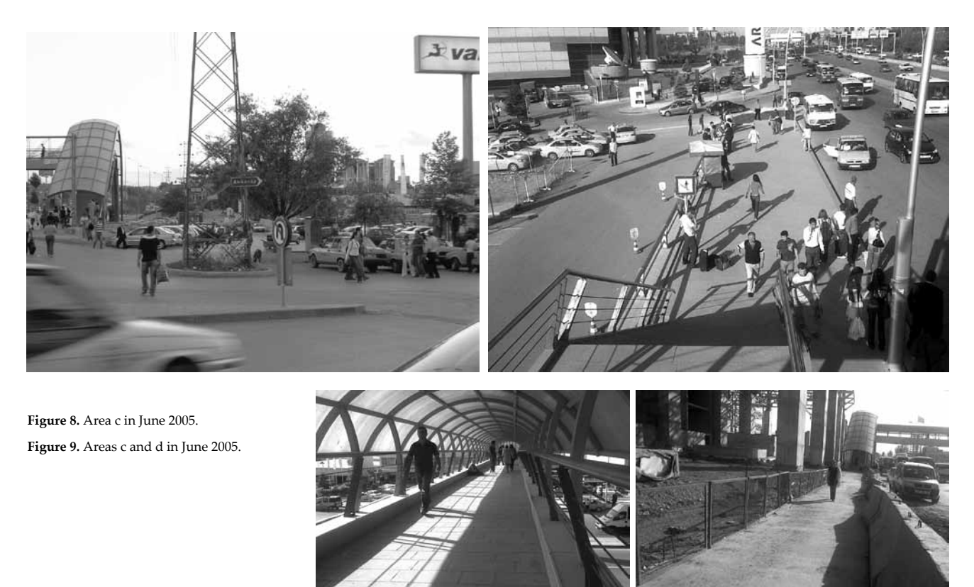
Figure 10. Area e in June 2007.Figure 11. Area f in June 2007.

of the participants had a university degree or a higher degree (53.80%); 35.7% of the participants were high school graduates and only 10.5% had primary school degree.