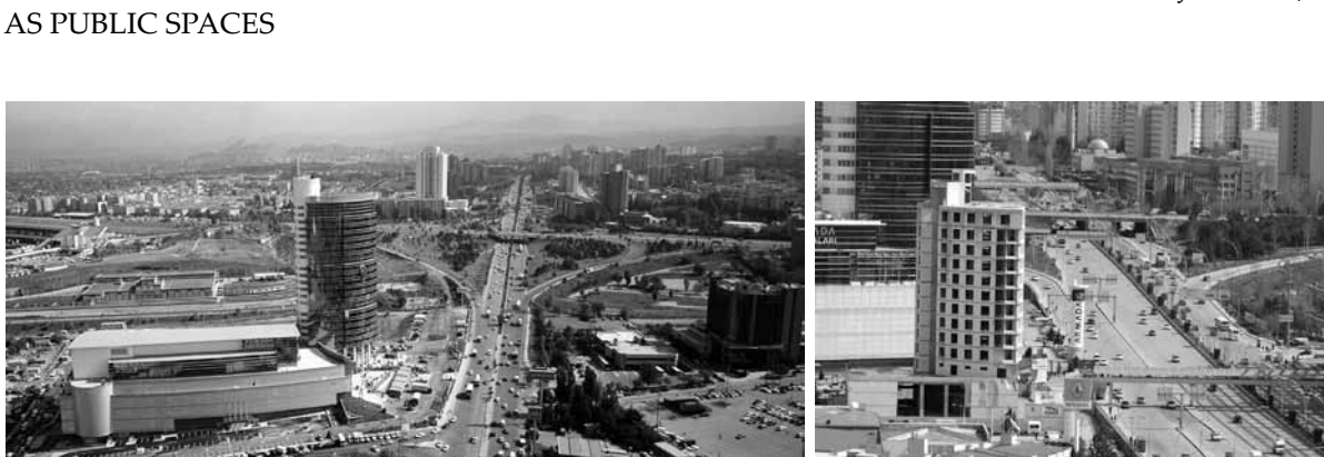
Figure 5. View of the area towards the city center (a) in 2003 on the opening day of Armada Shopping Mall; (b) in 2009 after the road expansion.

4. The number of lanes were totally seven in 2005: three lanes on both sides and one sub-lane towards the center. After the road expansion, total number increased to twelve with four lanes plus three added sub-lanes towards west, and three lanes towards the city with two added sub-lanes.