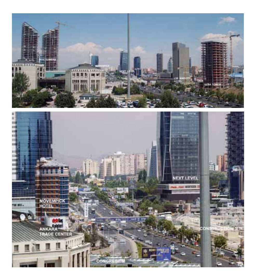
Figure 3. Current (2014) views showing the continuing increase in building density and functional diversity (a) in the surrounding section of the city (b) in the study area.

storey- high business complex to be the tallest building in Ankara ( Figure 3 ).