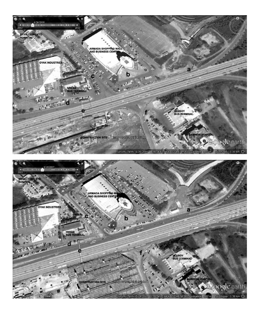
Figure 4. The study area and pre-defined locations for the questionnaires (a) in June 2005 -just before the first phase and (b) in May 2007-during the last phase (lanes and buildings indicated by authors on googleearth images).

During these two years, the vehicular density and capacity of the road has increased. In summer 2006, Ankara Metropolitan Municipality expanded the road by increasing the number of lanes from a total of seven to