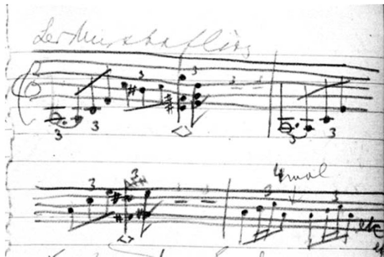
Figure 2: A melody written by Wittgenstein. Below it written: "That must be the end of a theme which I cannot replace." (CV: 19e)

language is generally intrinsic or hidden in Wittgenstein's writings; however, in some of his remarks, he expressly uses words like Tonsprache or musikalische Sprache (both mean musical language). Of course, these phrases do not by themselves point to music as a language, but we now know that Wittgenstein believes music as a fully expressive tool for communication.