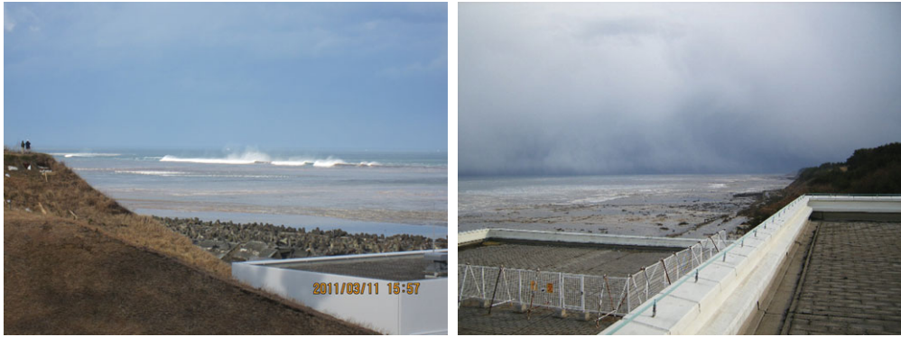
Figure 3. TEPCO photographs showing the coastal cliffs next to the Fukushima Dai-ichi NPP shortly after the tsunami ( http://photo.tepco.co.jp/en/index-e.html ). According to [32,42,43] the original ground surface at the seaside where Fukushima Dai-ichi was cited was at +30 m O.P. elevation. This can also be inferred by comparing the size of the persons to the height of the coastal berm. It was excavated to −4 m O.P. to obtain a more stable foundation, and the site ground level ‘was determined by comprehensively considering various issues such as tsunami height, work space, entrances, excavation costs, etc.’ [32].

and Go’s [14] catalogue, but has a vague reference to ‘investigation report by research institutes such as universities, etc.’.