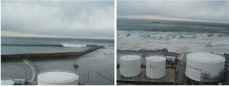
Figure 2. Tsunami attacking Fukushima Dai-ichi NPP.

EPCo volunteered to conduct an additional study considering the Japan Society of Civil Engineers (JSCE) method [36]. The study used initial conditions for the computations resulting from a parameter variation of the inferred source characteristics of M \sim 8.3 and M \sim 8.6 earthquakes, and they estimated a 13.6 m design tsunami height [35]. This analysis is consistent with what has been described as a superior culture of safety at the Tohoku EPCo [37,38].