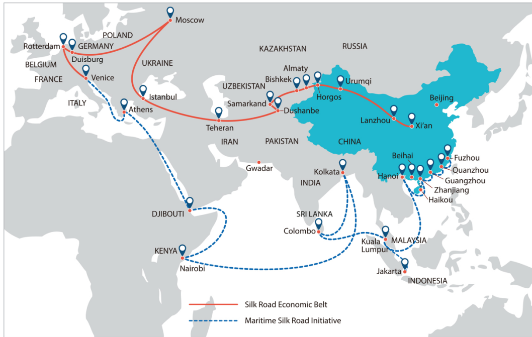
Illustration 1. The Map of the Belt and Road Economies 256