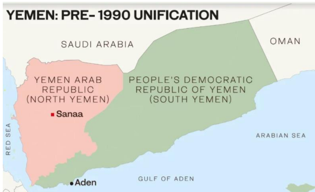
Map- 2:Yemen Prior to 1990 Unification