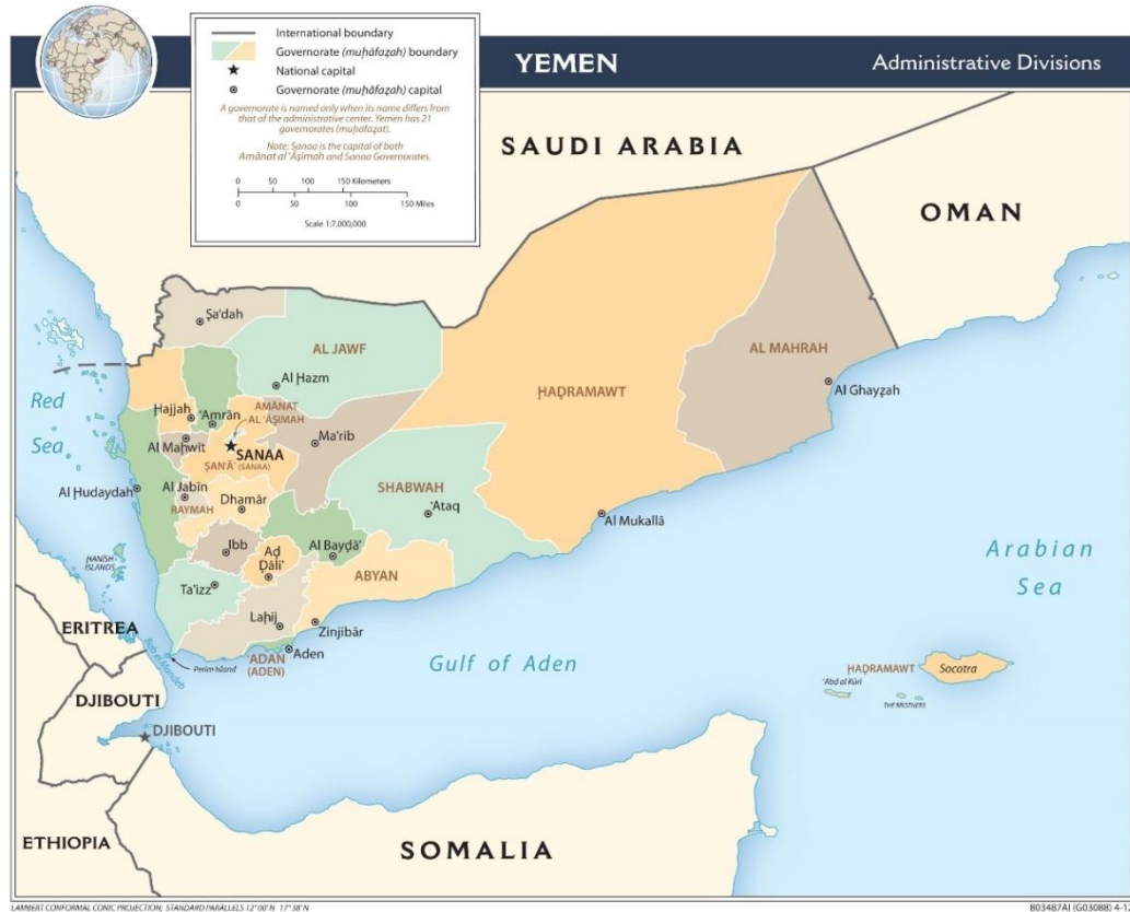
Map- 3: Republic of Yemen