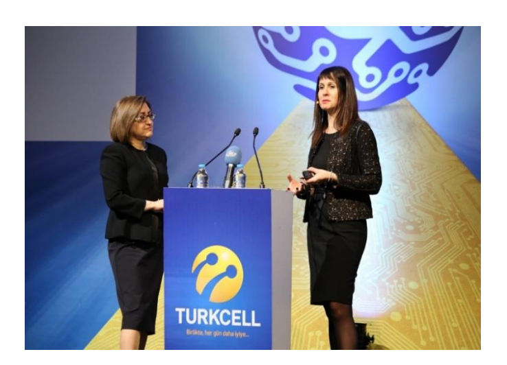
Figure 6: Kick-off Event of Smart City Project held by GMM and Turkcell

deniable and magnificent power of gastronomy was used in the image formulation, it has been built upon the solid ground. Moreover, a smart city project was conducted with the aim of technology-based urban development in Gaziantep by Gaziantep Metropolitan Municipality and Turkcell in 2015.