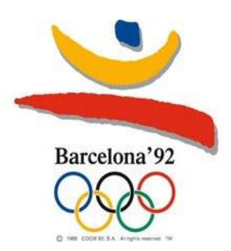
Figure 2: Logo of Barcelona

Hosting 1992 Olympic Games can be considered as one of the turning points of Barcelona as a city brand. It leads to both great transformation in the city and gave to chance to city to represent this transformation to the world.