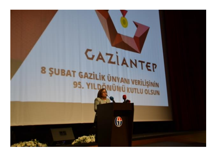
Figure 11: Launching Event of City Branding Project of GMM

were accelerated since the project was introduced by the private branding agency. It implies that ownership of the project was the private agency; however, this project was constituted by Gaziantep City Council, Gaziantep Chamber of Industry and other important stakeholders and implemented by Gaziantep Metropolitan Municipality.