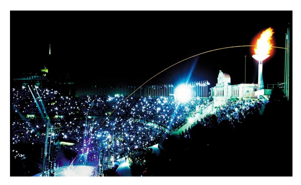
Figure 3: Olympic Games 1992

The Olympic Games has taken the attention of tourists and urban designers due to infrastructure projects like airport expansion, highway rings, telecommunications and like.