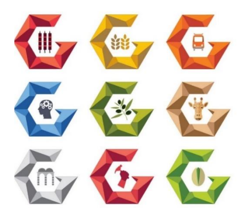
Figure 10:Different Versions of Gaziantep's Logo