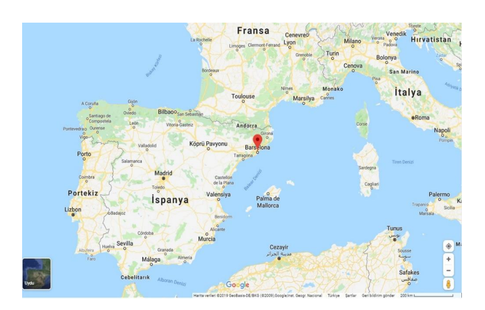
Figure 1: The location of Barcelona

Barcelona having more than 1.6 million inhabitants and the second largest city in Spain and capital city of the region of Catalonia is one of the famous cities of the World (Belloso, 2011).