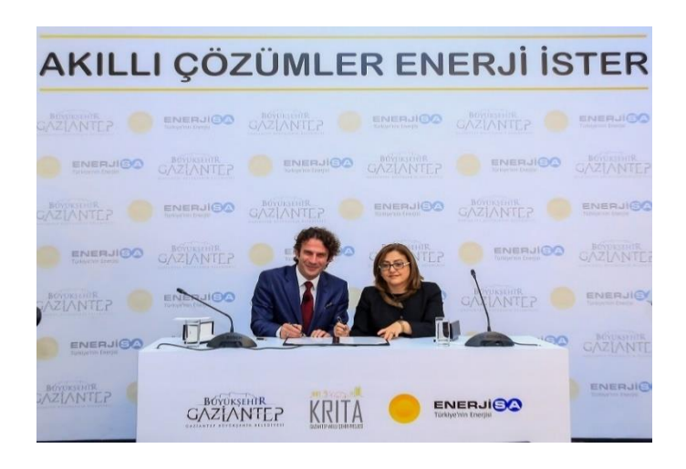
Figure 7: Kick-off Event of Smart City Project held by GMM and Enerjisal

Our Municipality, which has undertaken a pioneering project for energy management, energy efficiency, and renewable energy, has accelerated its projects for energy production from renewable energy, wind and biogas resources. We are assertive about efficiency, development, innovation and smart city planning in Gaziantep. Smart City Gaziantep project will take our city forward and be an example to other cities in Turkey and the world6.