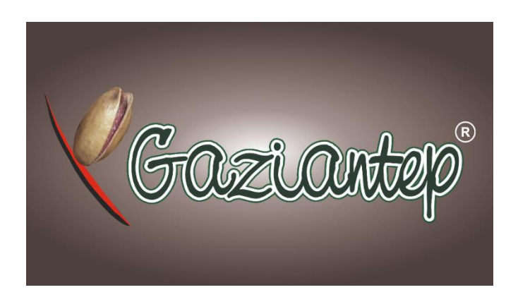
Figure 9: Trademark City Gaziantep Project's Logo

Also, the logo of the city was produced for the first time in Turkey to present the companies from Turkey. Turkish Patent and Trademark Office was approved the logo as well.