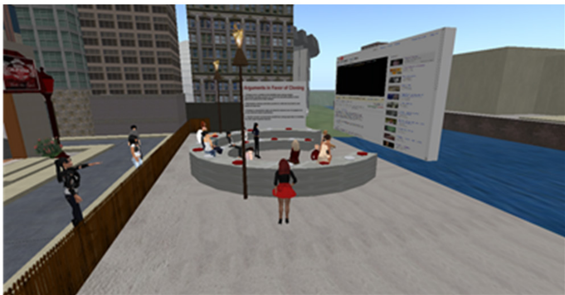
Figure 2. Discussion Area

The purpose of the “In the States” task was to prompt students to discuss a controversial topic, cloning. For this purpose, a discussion area was designed (see Figure 2).