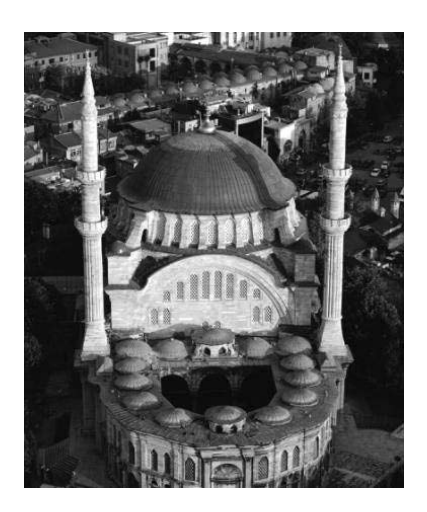
Figure 3. The Nuruosmaniye Complex.

6. There is also the story of a blessed old man who greeted Mahmud I at the corner of the street and started to cry and pray for his health, thanking him for having chosen this site for the erection of a lofty honorable mosque and for making the people there very happy; the sultan hence decided to have a royal mosque built there. See, Ahmed Efendi (1918).