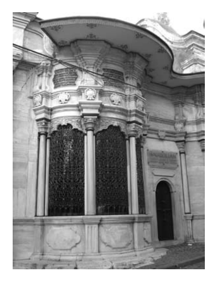
Figure 7. The fountain- sebil of the Nuruosmaniye.

merchants in the Bazaar , reconfirming Ahmed Efendi's observations on this matter.