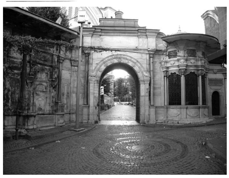
Figure 5. The çeşme and sebil of the Nuruosmaniye.