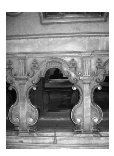
Figure 14 . Ornamental detail, the Nuruosmaniye Mosque.