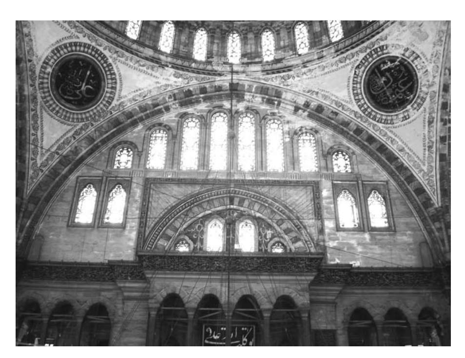
Figure 1. View from the interior, the Nuruosmaniye Mosque.

Started during the reign of Mahmud I (1748) and completed shortly after his death (1755), the Nuruosmaniye in Ottoman architectural history is considered to be the first royal religious complex displaying baroque and neo-classical elements such as shells, scrolls, molded cornices, and cartouches in its flamboyant surface decoration. Since it is the first sultanic complex built after the Yeni Valide mosque (completed in 1663), the Nuruosmaniye can also be considered as the visible expression of the dynasty's efforts to reaffirm its power and potency in a period of political and economic hardship through the use of an innovative architectural vocabulary.