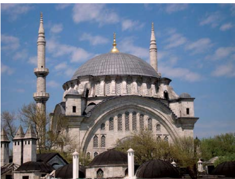
Figure 2. The Nuruosmaniye Complex.