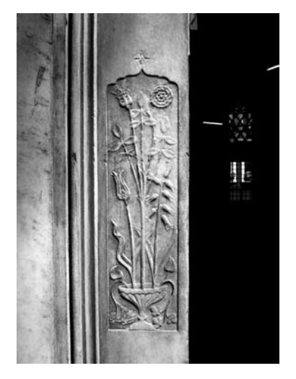
Figure 6. The library, detail.

In vernacular language the complex is called Nuruosmaniye, which is derived from Nûr-1 'Osmâniye, meaning the 'heavenly light of Osman'