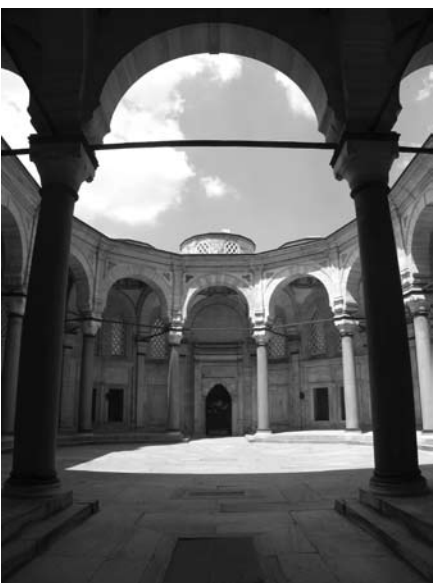
Figure 8. The courtyard of the Nuruosmaniye.