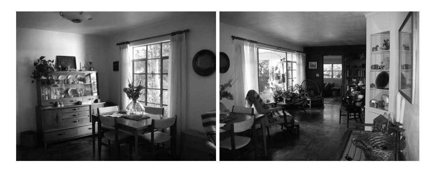
Figure 11 . Dining room and living room come together. (Photo by Barbara Pietsch in 2007).

family china, a great example of how the family's personality altered the architecture of the home ( Figure 11 ).