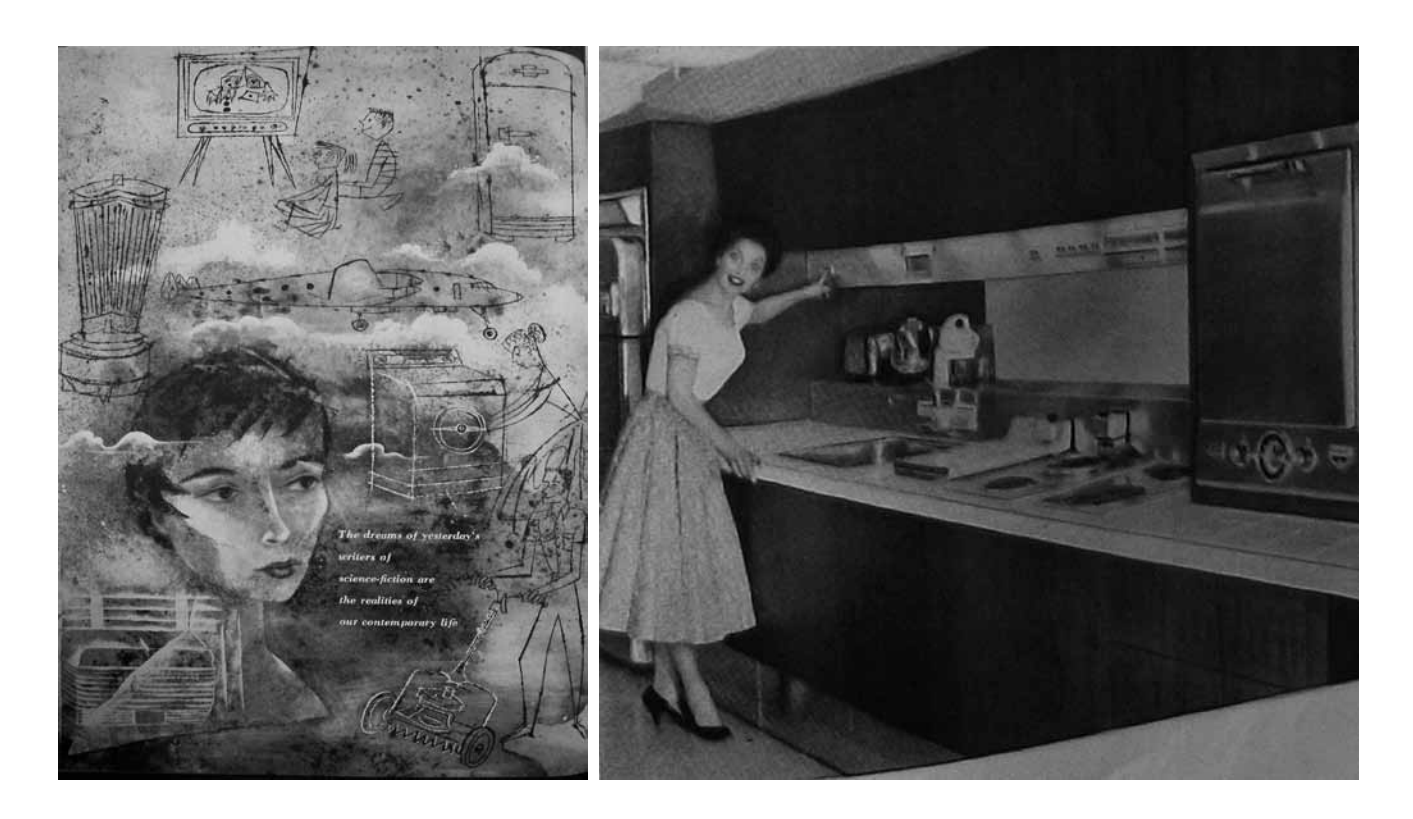
Figure 2. The dreams of a housewife in the 1950s (Barry, 1955, 62).

Figure 3. Media reinforced the ideal image of family by showing housewives as happy and elegant. (Barry, 1955, 99).