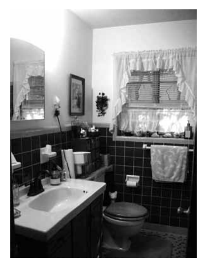
Figure 16. The main bathroom.

closet adorning the formal look that was typical of every day life. If the master bathroom was being used, anyone could use the small bathroom. The family all took showers at night so that they could get ready very quickly in the morning. Howard never used the main bathroom ( Figure 16 ). He always used his own bathroom which was small and connected with the master bedroom. After 1960, the house had three bathrooms: the main bathroom, the master bathroom and a new bathroom located in the converted garage.