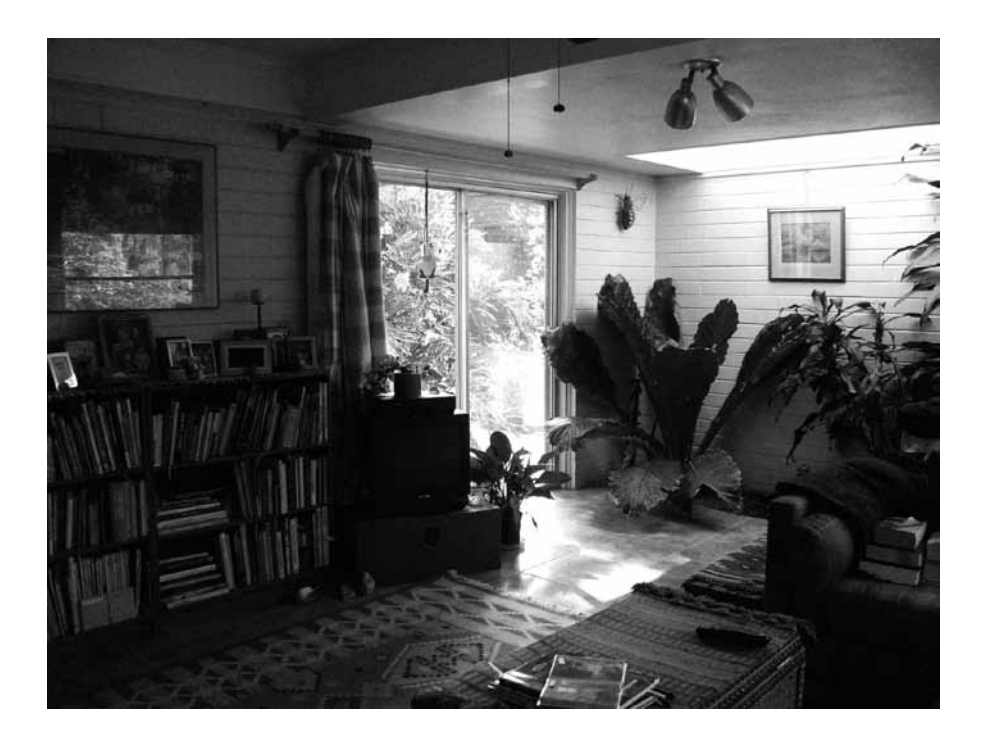
Figure 14. Florida room.

In the early 1960's the TV was moved into the Florida room. During our interview, Paul made it clear that the Florida room was one of the most desirable components of the household. The Florida room was made from the old porch and was like many built at that time. Howard had a unique