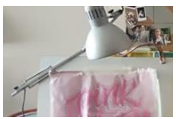
Figure 3: Bed used as a storage space

Students prefer quick and easy repair and develop their ways to fix products like in the example of attaching a table lamp to different surfaces and putting an extra layer between the mattress of the bed and base. However, they do not change the cover of the couch by themselves because it requires specific skills. We conclude that difficulty, laziness, lack of motivation and time are the reasons for limited repair and appropriation of products in the student houses. As in the Van den Berg and Bakker's (2015) circular design guideline, disassembly and maintenance are significant for designing products for student houses; the components need to be removed, cleaned and changed for easy repair and longer usage time. Therefore, if products are open to user intervention and designed for easy repair, the exchanged products in student houses can have longer usage time and students can be encouraged to repair and appropriate them.