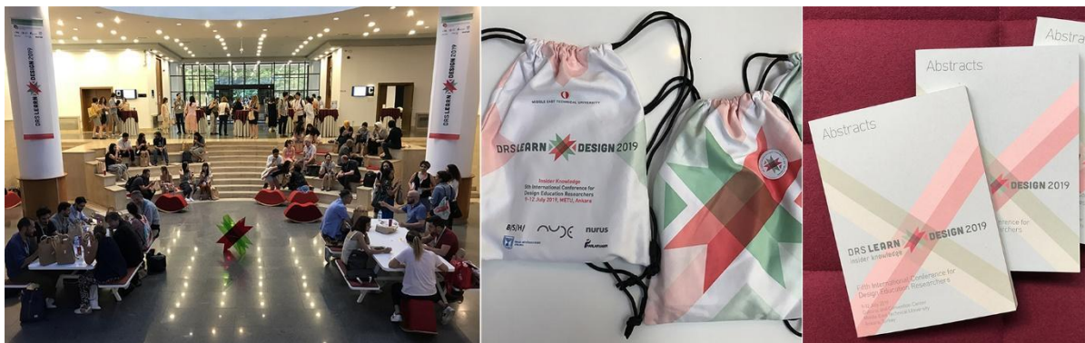
Figure 5. Left: Conference venue during lunch break. Centre: Conference pack. Right: Book of abstracts.

We believed it was important to be able to support the conference community in an inviting environment. We wanted the conference venue to reflect the conference visual identity, and accommodate the technical and social needs of the delegates. The venue was furnished by one of our sponsors to host the social gatherings during coffee and lunch breaks (Figure 5, left), as well as to provide quiet areas for the delegates. There were also two sponsored exhibitions in the venue: a photography exhibition on the work of contemporary Turkish architects, and an exhibition of glassware products by Turkish and international designers. We did our best to prepare a joyful conference pack that included the book of abstracts and pins for social events (Figure 5, centre and right).