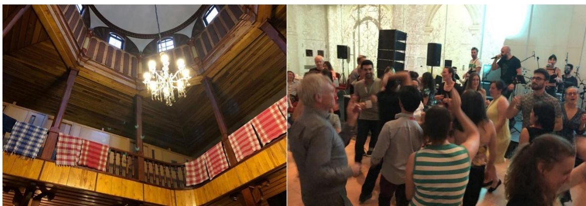
Figure 6. Left: The Turkish bath visit, 10 July 2019. Right: The conference dinner, 11 July 2019.

We believe we have learnt a lot from this 21-month experience. Before the conference, during the preparations, we learned the value of developing and agreeing on a shared goal, and how this can bring parties, located in different parts of the world, closer. Our belief in hard work, team effort, collaboration, compromise and friendly communication has been strengthened. Having to work early morning hours and late evening hours, and running against deadlines reminded us of effective time planning, efficient coordination and prompt responses to enquiry. During the conference, we remembered the value of cultural, institutional and personal diversity, and of having young and senior researchers together. We were inspired by new knowledge, and its power in building a global design education research community. We also discovered the strength of social media, supported by branding and visual identity, which we made use of before, during and after the conference, in effectively communicating to reach out and keep in touch.