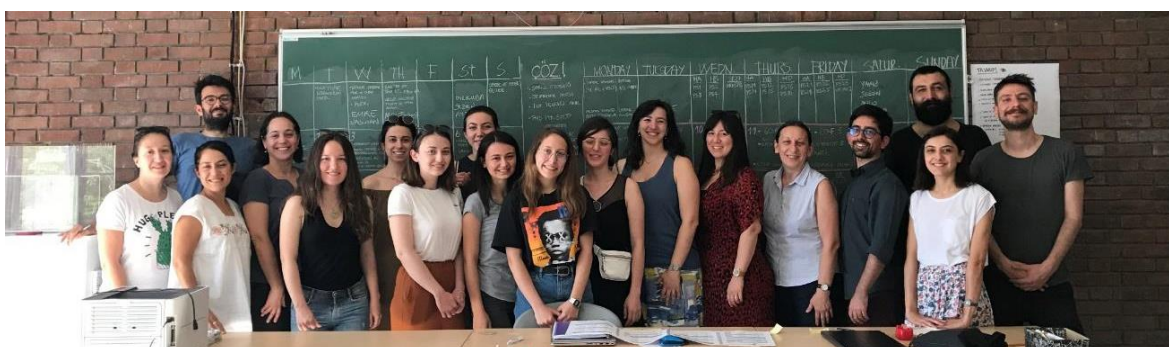
Figure 7. The conference team, during preparations.

With this experience, we once again were able to see that it is people that bring an event to life, give it meaning, and pass its legacy onto future generations. We thank the organisers of the DRSLXD2019 conference, DRS PedSIG and METU. We also thank the Programme Committee, International Board of Reviewers, track chairs, keynotes, short lecturers, PhD Pit-Stop mentors, workshop organisers and panellists. We thank our sponsors, Ankara Embassy of Israel, BSH, Nude, Nurus, MPV Mustafa Parlar Foundation, and METU. We also thank the local administrative team, editorial support team, visual communication support team, and the conference team who were out on the field, showing an amazing effort in the realisation of the event (Figure 7).