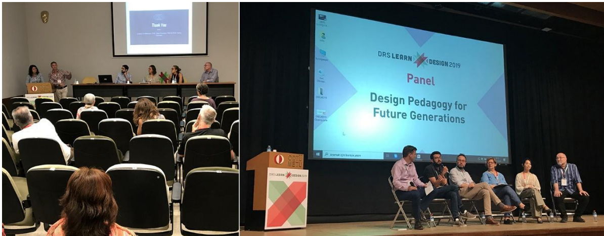
Figure 3. Left: Paper presentation session. Right: Concluding panel on the final day, 12 July 2019.

The following three days of the conference accommodated two more workshop sessions running parallel to 27 paper presentation sessions. We had either two or three parallel sessions for paper presentations (Figure 3, left). In total, we had 150 delegates from 88 institutions spread across 27 countries.