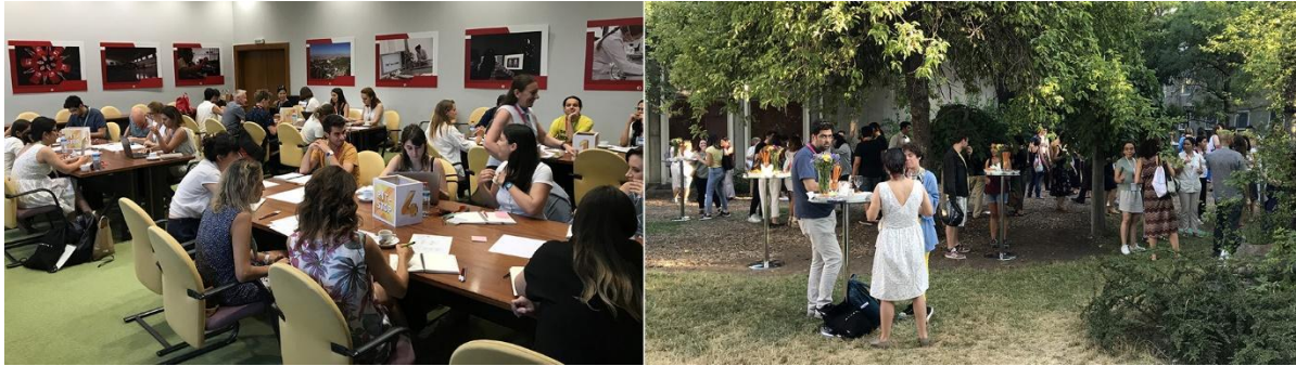
Figure 2. Left: PhD Pit-Stop workshop in the afternoon. Right: Conference welcome reception at the Faculty of Architecture front garden in the evening, 9 July 2019.

The conference programme was set up to accommodate a full-day PhD Pit-Stop on the first day, with three workshops running in parallel. Twenty-four PhD researchers joined the PhD Pit-Stop. The PhD Pit-Stop was supported with four short plenary lectures by Gülay Hasdoğan, Owain Pedgley, Peter Lloyd, and Gülşen Töre Yargin, open to the participation of all delegates, besides the PhD researchers. PhD researchers made their presentations and received feedback provided by the mentors in the morning, and they joined a workshop in the afternoon (Figure 2, left), where they were able to discuss their research interactively with all mentors involved. On that evening, the conference welcome reception was held at the front garden of the Faculty of Architecture (Figure 2, right). We believe this first day, and the social event concluding it at a karaoke bar, were among the events characterising the conference.