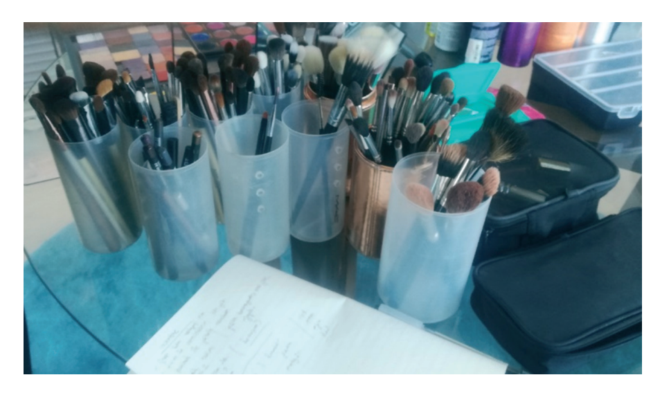
Figure 2. Make-up tools used by the artist.

different formulas, chemical states, and pigmentation levels. Furthermore, the properties of a product such as color, texture, fluidity, and opaqueness may appear on the skin unlike how they seem on the pan. Make-up tools, such as brushes, sponges, even tweezers, also have specific uses in combination with specific materials, and diverse ways to apply them – e.g., angles, lines, pressure, or repetitions. An example is the fan brush, which is used to highlight higher points on the face such as cheekbones. However, the artist that Tok observed used it to contour the hollows of the cheeks, to darken the shadows. He pointed out that, when his fellow make-up artist had recommended this "make-up trick", he had not been convinced at all, but was surprised when he experienced it. Thus, the recognition of the purpose of a tool and its mode of operation can also be interpreted as an extended cognitive process.