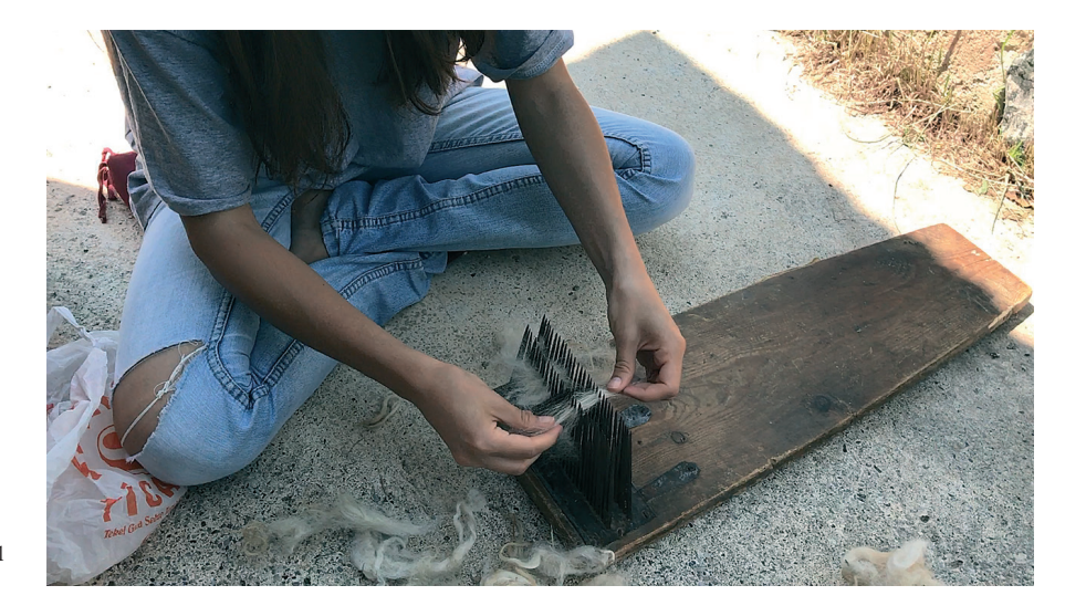
Figure 1. Felting is a way of entangling wool fibres to create a nonwoven textile.

Aktas's research documented felting by hand and with tools by visiting felting studios and industrial producers. Tools range from simple needles that are recent innovations, to fully automated production. The processes and outcomes of these significantly differ from each other, and shape makers' relationship with and closeness to the material. Following postphenomenological accounts of human-technology-world relations (Ihde 1990), it can be argued that different technologies of felting bring different interaction models and diverse forms of mediation. With a felting needle, tool becomes an extension of the hand, and form is created through wool-needle-hand interactions (an "embodiment relation"), whereas in semi-industrial production, the interaction between the material and the body is limited to the phases before and after entangling fibres, as the machine, the tool, does a significant amount of entangling work through becoming an intermediatory between the body and the material. Finally, in fully automated production, makers interact mostly with intermediary tools such as computer software that translates ideas to machine language, and the material interaction happens only after the production where the material becomes an artefact. Here, a "hermeneutic relation" tends to override "embodiment relations" since the maker develops design decisions with the representations of their ideas through the software; but